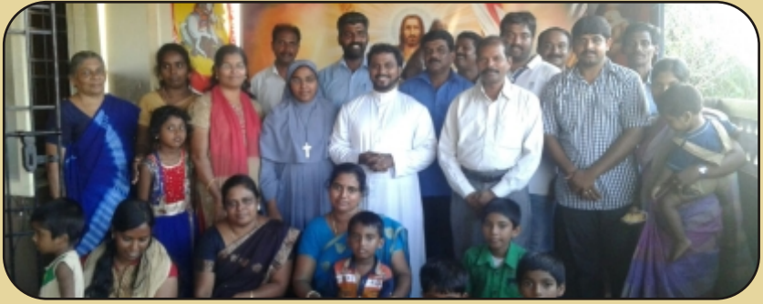
The New Malankara Community at Thamparam, Chennai