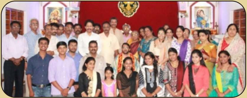
Aurangabad Parish Community on Easter Day Celebration