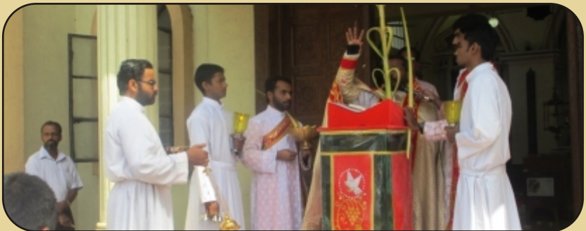
Holy Week Service at Warje Malwadi