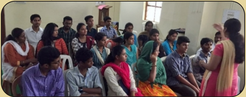
Resource Team Meet - Matikkare