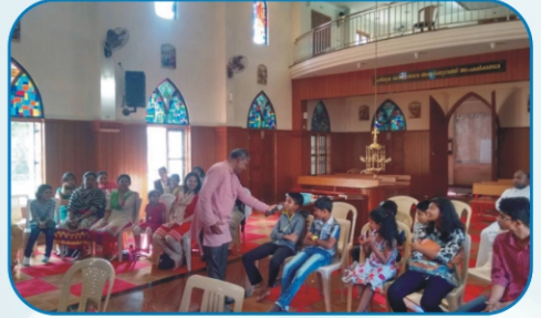
Sunday School Workshop, Hennur