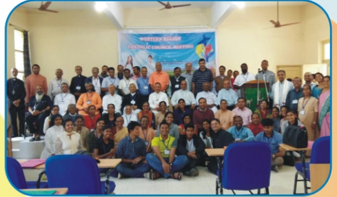
Members from the Exarchate along with the other participants of WRCC, Nadiad-Gujarat