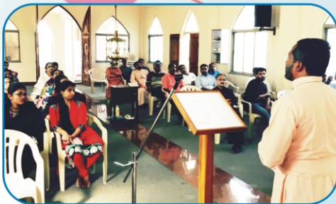
Year of Mercy Concluding Session, Chinchwad