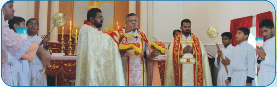
Closing Ceremonial Qurbano of the Year of Mercy at the Cathedral Church