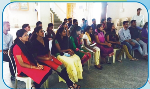
Resource Team Session, Kalewadi