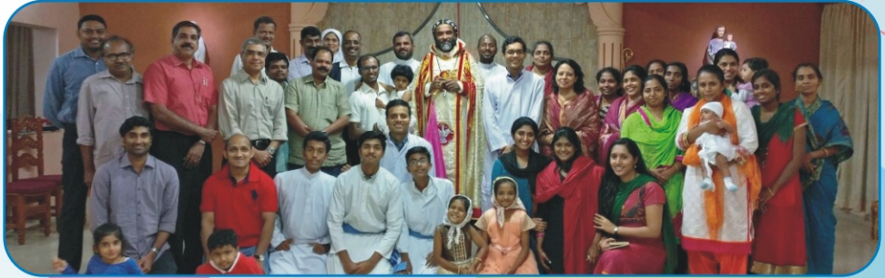
Bishop's Visits to Carmelaram Parish