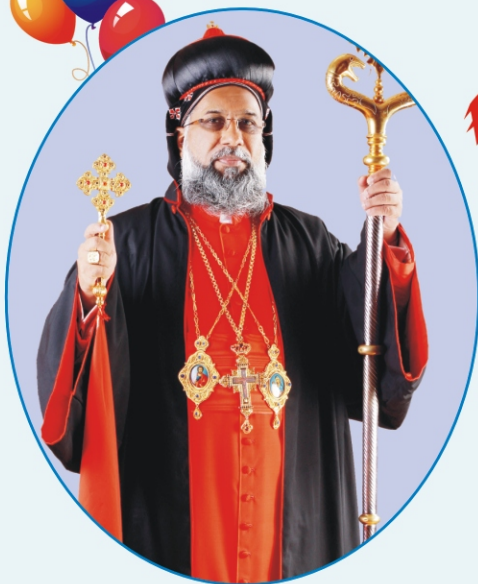
Moran Mor Baselios Cardinal Cleemis Catholicos 1 January