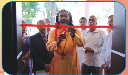
Foundation Stone Laying and Inauguration of the New Principal's Office of Mar Gregorios Public School, Chennai