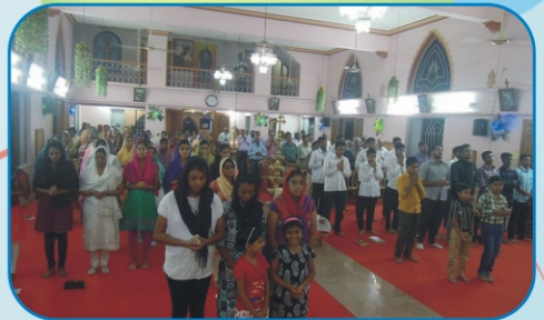
Parish Retreat, Kalewadi