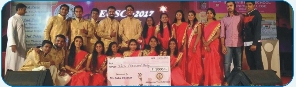
The MCYM Kalewadi bags 3rd Prize for the Carol Singing Competition