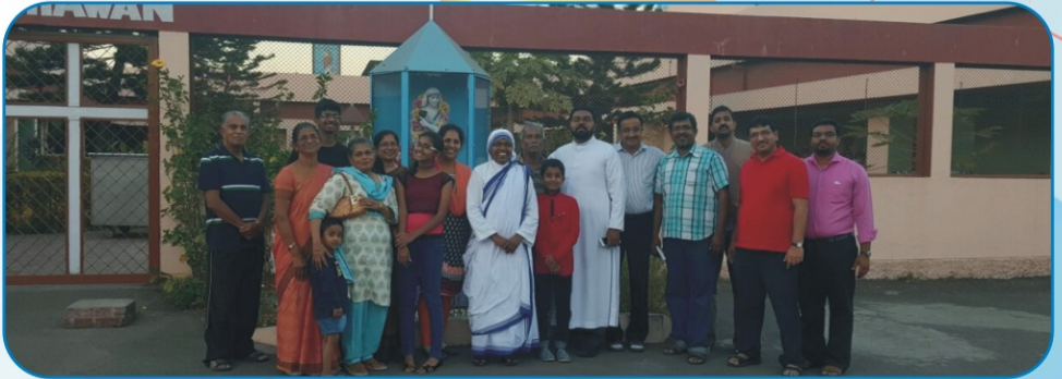
The Cathedral Parishioner's visit Prerana Bhavan