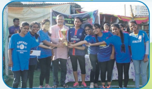
The Vishrantwadi Boys & Girls team win the football tournament organised by the MCYM of Dehuroad & Chinchwad Parishes