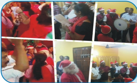
Christmas Carols, Goa