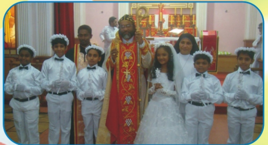
First Holy Communion, Thane