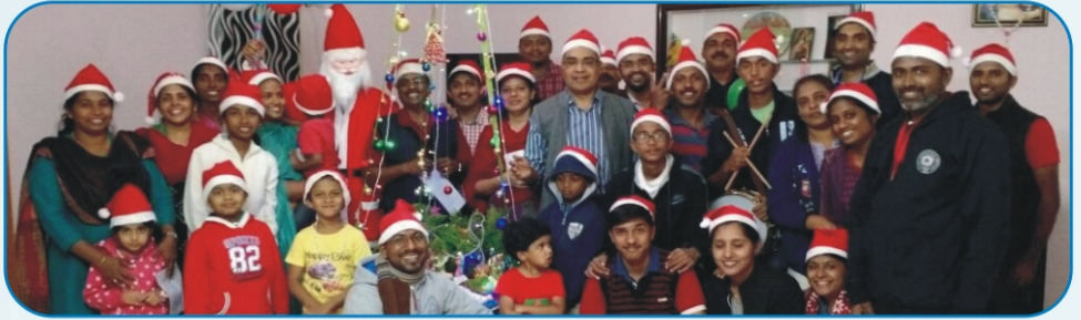
Christmas Carols - St Alphonsa MSCC, Carmelaram