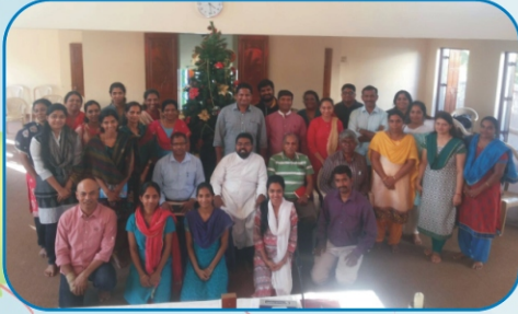
Catechism Teachers Seminar, Pune District