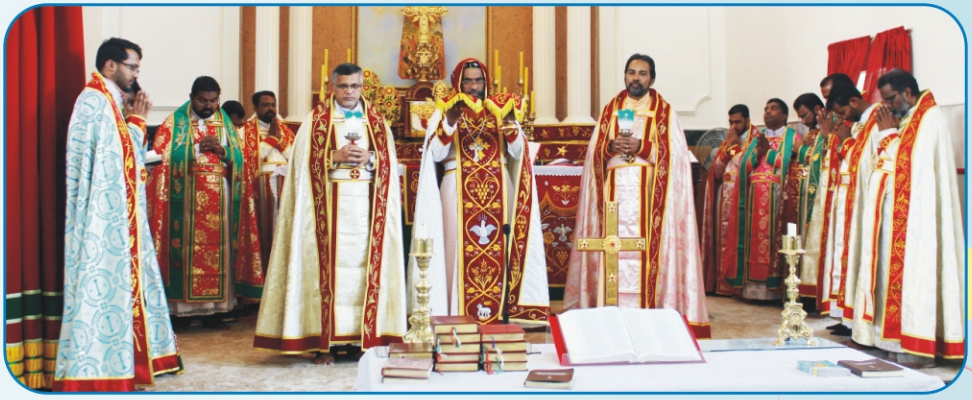
Exarchate Priests Meet, Pune