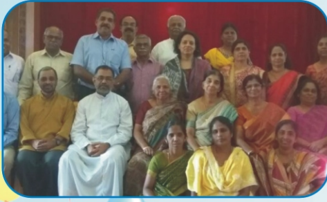
Suvisesha Sangham Formation, Bangalore and Chennai