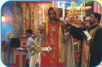
Festal Celebration, Borivali